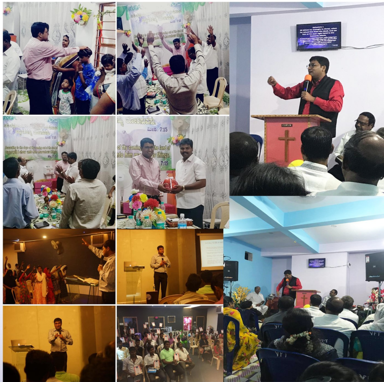
Discipleship and Church Growth Conference at Kovaipudur