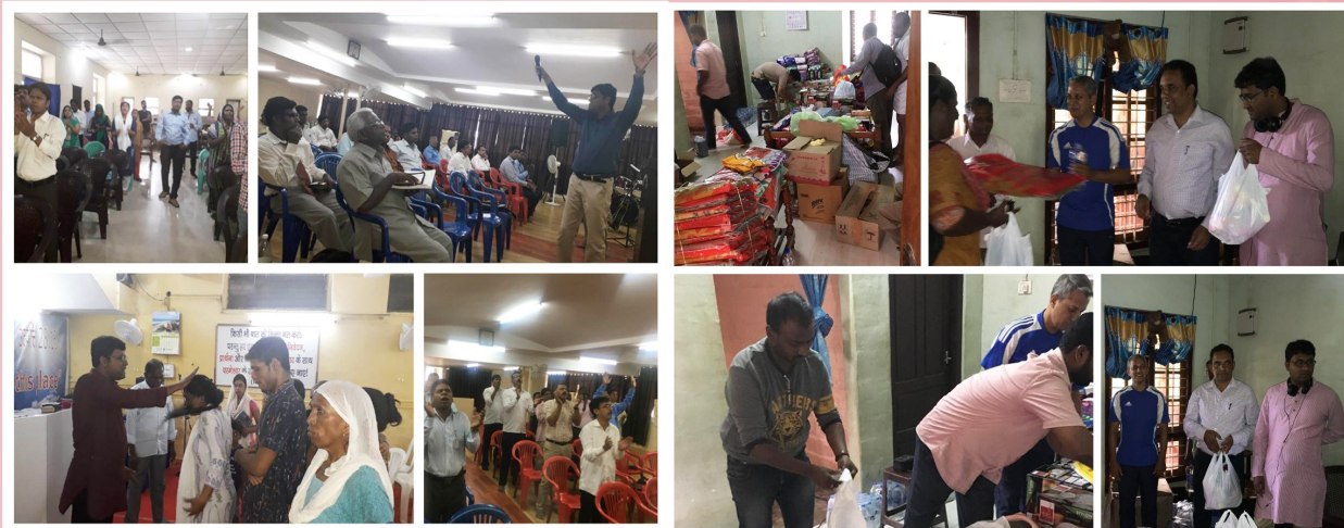
Delhi/UP Pastors and Leaders Meet

In the wake of unprecedented floods in Kerala, the Church reached out with Relief materials, provision and financial aid to the affected in Wayanad, Pandanadu and Kuttanad.